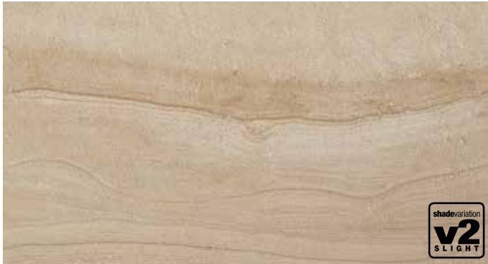
Bourgogne NE 12 ST

Spacers are recommended for all porcelain paver installations.