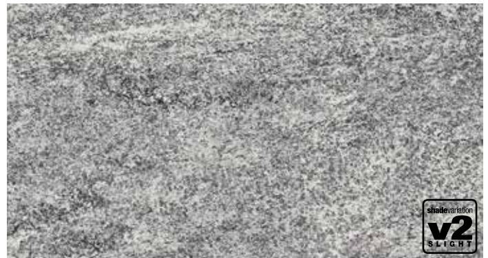
Swiss Grey NE 20 ST

Actual size & color may vary. Check with your local provider for availability and pricing.