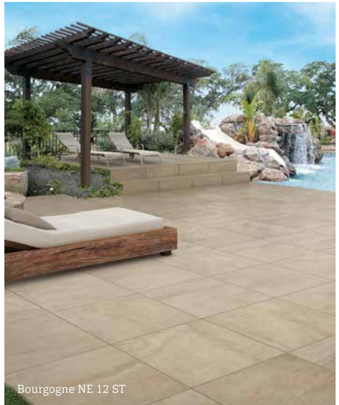
Bourgogne NE 12 ST

PLEASE NOTE: For vehicular applications, must be a mortar install over a concrete slab.