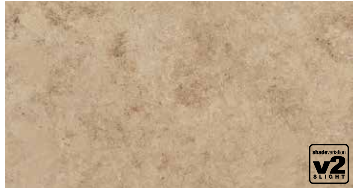
Jura Beige NE 10ST